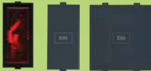
21180RMB 21598MB 30420MB