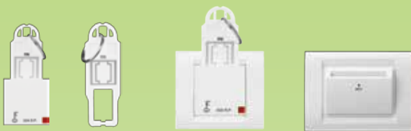
21770 20868 Final Look 20482

• 35774 - Suitable for AMPS, krone, Systimax Jacks - 35220 - Suitable for Avaya Lucent