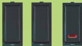
21066MB 21088MB 21077MB