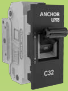
Roma Classic Mini MCB SP