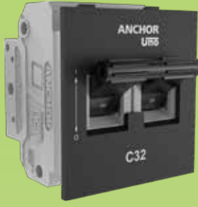
Roma Classic Mini MCB DP