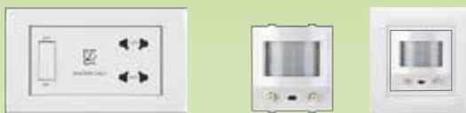
22069 20824 Final Look